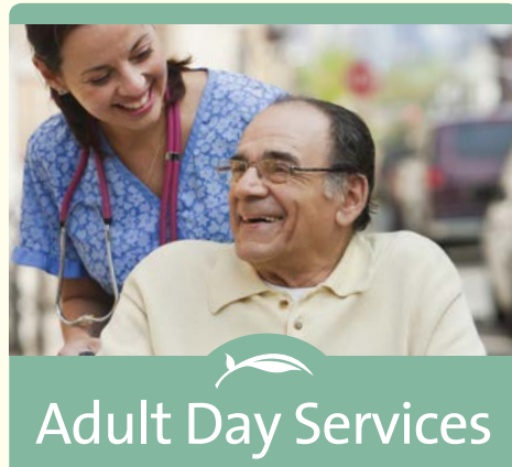
Adult Day Services

Sagepoint offers welcome support for families with a loved one who needs supervision and medical services during the day. We serve elderly individuals with chronic health issues or memory loss, and people 16 and older with intellectual disabilities.